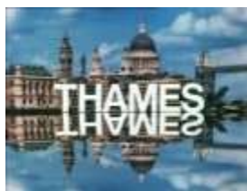
The Thames television ident introduced in 1970 when colour broadcasts began. It was used for the next 20 years.

The Sweeney is an iconic British police drama produced by Thames Television in the mid-1970s. Thames was both a broadcaster of the British ITV television network, covering the London area, and a producer of television programmes.