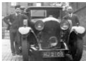
Flying Squad officers with their Bentley, circa 1930

vided with horse-drawn covered wagons to patrol the streets, with interchangeable names of businesses slotted into the sides of the wagons. Underneath the canvas hoods, the detectives looked through spyholes to catch thieves. Because they could operate anywhere in the Metropolitan Police District they were called The 'Flying Squad'. The 12-month experiment was so successful that motor cars soon replaced the wagons.