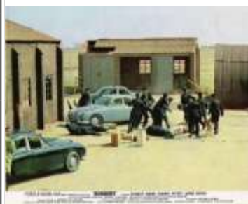
Robbery Cinema Lobby card see Newsletter Vol. 8, No. 6

By the time of the 'S'-type, the Flying Squad detectives numbered over a thousand, and are still called 'the Sweeney' today.