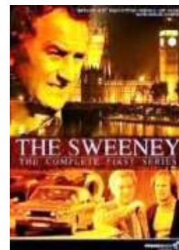
The Sweeney opening Series 1 DVD case

In The Sweeney series 1, Inspector Jack Regan is usually driven in an unmarked Ford Granada. 'S'-types appear in six of the 13 episodes, but there is not one in the first episode, where the crooks use a white XJ6 in a hijacking. There are two 'S'-type car chases in Episode 10, Stoppo Driver , and another in Episode 11, Big Spender in which the opening 'S'-type, DWD606C, appears. All series 1 episodes were shot in 1974.