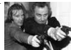
A young John Thaw with his co-star Dennis Waterman

A young, age 32, John Thaw starred in The Sweeney television series, a decade before becoming famous for driving his Jaguar Mk2, in his role as Inspector Morse , in the 1987-2000 television series of that name. If you watched Inspector Morse , you will recognize the 10-years younger John Thaw, but not his hard edged, undisciplined, frequently violent, often devious and sometimes illegal, but usually successful investigative methods as he pursues the villains of that era.